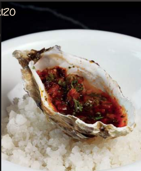
CHORIZO 680.- (3pcs)