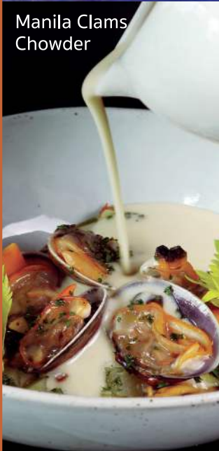
Manila Clams Chowder