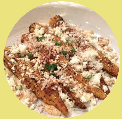
Charred Baby Corn 320.- Feta Cheese/Smoked Paprika