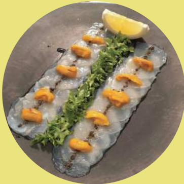
Wild Scallops Uni Carpaccio 1,350.- Hokkaido Wild Scallops/ Sea Urchin/ Truffle Vinaigrette