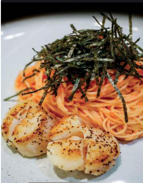
Angel Hair Vongole' 720.- Clams/ White Wine