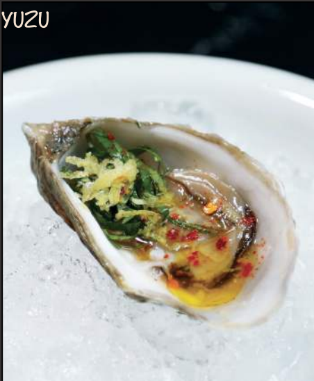
KOCHIYUZU 680.- (3pcs)