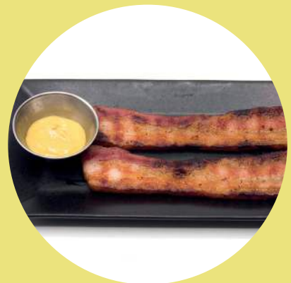
Apple Wood Chips Smoked Bacon 320.- Mustard