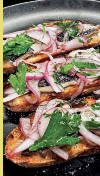
Grilled Sardine Toast