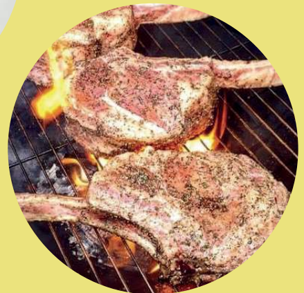
Ebony Black Angus TOMAHAWK 600.-/100g