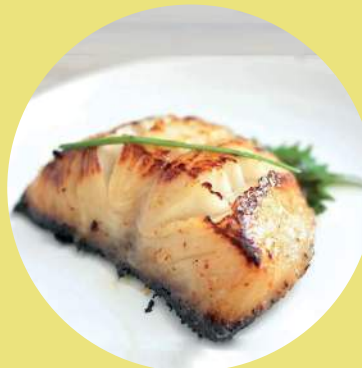
Gindara Japanese Black Cod 720.- Miso/ Charred Vegetables