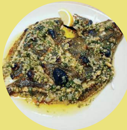
Josper Grilled Turbot 360.-/100g Pan Sauce: Lemon/ Capers