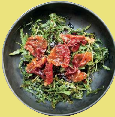
Warm Rocket Salad 350.- Crispy Parma Ham/Bacon/Balsamic Reduction