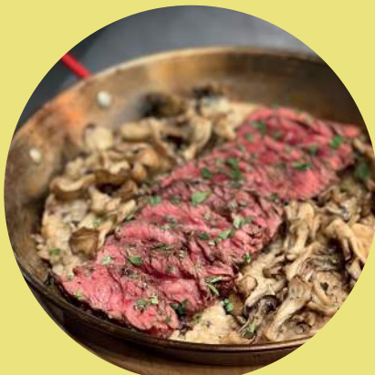
Wagyu Beef PAELLA 1,850.- Charred Maitake Mushrooms