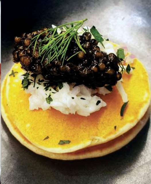
CLASSIC BLINI CAVIAR