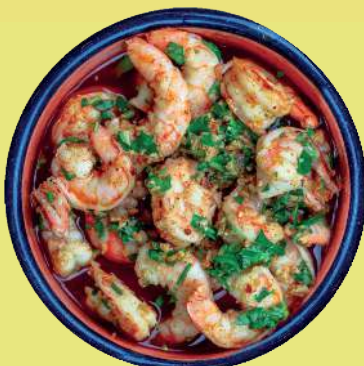
Gambas al Ajillo 450.- Spanish Garlic Prawns