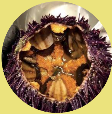
Live Sea Urchin 520.- /100g