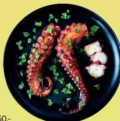
Grilled Octopus Tentacles 1,450.-

Prices are subject to 10% Service and 7% VAT