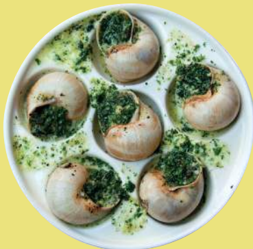
Escargots Bourguignone 590.-