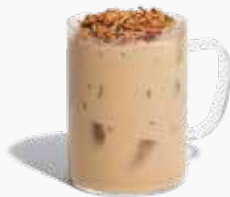
Ape Leopard 150.-

Rich coffee mixed with tea and a fresh milk.