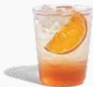
Arc Hill 130.-

Citrus coffee combined with fresh milk creates a sweet tastes just like dessert.