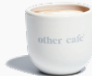
Espresso Macchiato 95.-

Rich espresso, a perfect shot with hard body crema.