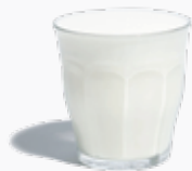
Hot Milky Vanilla 80.-

Experience the taste of rich chocolate mixed with a sweet hot milk.