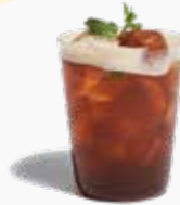
Cold Brew Red Plum 130.-

The refreshing sourness of apple vinegar combined with cold brew coffee.