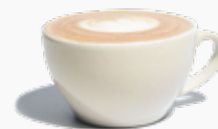
Hot Cappuccino 100.-

Aromatic espresso mixed with gentle touch of hot milk.