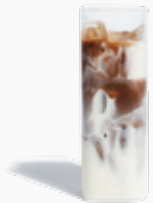
Iced Mocha 120.-

Savor the rich espresso blended with cocoa, paired with cold fresh milk.