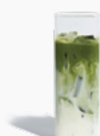
Iced Matcha with Milk 130.-

Enjoy the original taste of premium green tea from Uji, Japan.