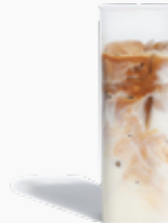
Iced Caramel Macchiato 120.-

Savor the rich espresso blended with cocoa, paired with cold fresh milk.