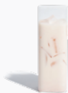
Iced Milky Strawberry 100.-

Taste the rich chocolate mixed with milk.