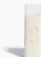
Iced Milky Vanilla 90.-

Fresh milk mixed with a hint of vanilla scent, combined with strawberry.