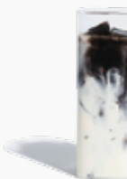
Iced Black Cacao 110.-

Special rich thai tea and milk, sweet and creamy, making it a must-try!