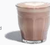
Hot Chocolate 100.-

The premium taste of matcha from Uji, Japan, complemented by warm milk.