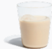
Cold Brew Latte 110.-

Refreshing taste from orange & lemon that pairs well with espresso and soda.