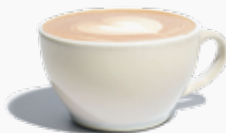
Flat White 100.-

Aromatic espresso mixed with gentle touch of hot milk.