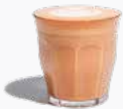
Hot Thai Tea with Milk 100.-

Rich thai tea combines with warm fresh milk.