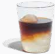
Cold Brew Yuzu 130.-

The unique blend combines the cold brew coffee with the sweet-tart notes of plum.