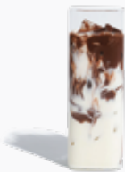
Iced Chocolate 110.-

Black cacao combines with the sweetness from fresh milk.