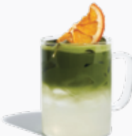
Yuzu Matcha 130.-

Matcha with cold milk, featuring the premium taste of Uji, Japan's finest matcha.