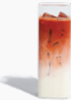
Iced Thai Tea with Milk 110.-

Explore the relaxing taste through gentle vanilla aroma and warm milk.