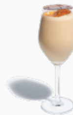
Kenzo Volcano 150.-

Citrus coffee combined with fresh milk creates a sweet tastes just like dessert.