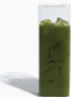
Iced Matcha 100.-

The gentle flavour of cold fresh milk, with a soft scent of vanilla.