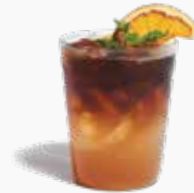
Cold Brew Tropical Fruit 130.-

Citrusy and tangy taste of yuzu that pairs well with coffee flavour.