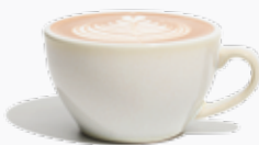
Hot Mocha 110.-

The combination of warm milk and the aroma of coffee with cocoa.