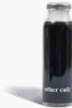
Cold Brew Concentrate 150.-

The perfect combination of cold brew coffee and fresh milk.