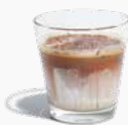
Triple S 130.-

Espresso combined with sweet & creamy cold milk, top with chocolate flakes.