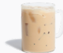
Iced Cappuccino 110.-

The perfect combination of strong milk coffee topped with milk foam.