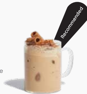
Thai Crispy Latte 130.-

Coffee with coconut milk, the taste of heavenly dessert in a cup.