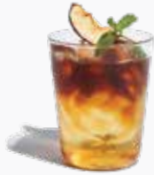
Cold Brew Apple Cider 130.-

The refreshing sourness of apple vinegar combined with cold brew coffee.