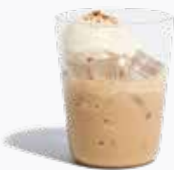
Tan Mountain 150.-

The perfect combination of strong milk coffee topped with milk foam.